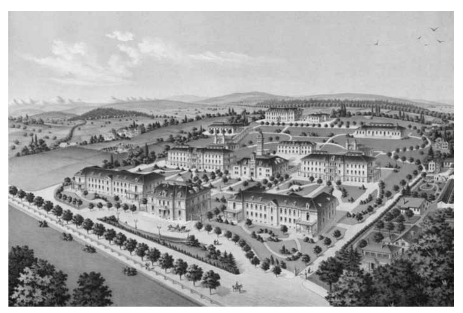
Figure 3. The University Hospital, the Inselspital , in Bern, Switzerland, in 1884.

ding member and the first president of the Swiss Society for Surgery, and he was the President of the German Society of Surgeons (1902) and the President of the First International Surgical Congress in Brussels in 1905.