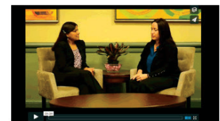
Anaplastic Thyroid Cancer – Support Research for Treatments April 17, 2016