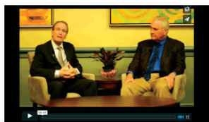
Differentiated Thyroid Cancer – Support ATA's ongoing Research April 17, 2016