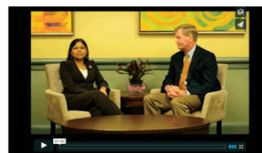
Medullary Thyroid Cancer – Help the ATA Find a Cure April 17, 2016