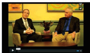
Differentiated Thyroid Cancer – Support ATA's ongoing Research April 17, 2016