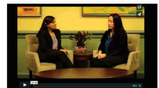
Anaplastic Thyroid Cancer – Support Research for Treatments April 17, 2016