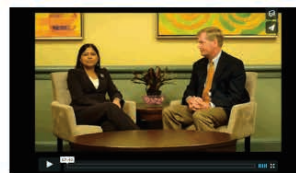
Medullary Thyroid Cancer – Help the ATA Find a Cure April 17, 2016